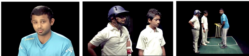
Cricket coaching on KidsHubTV India

It is hoped that as a result of seeing KidsHub videos children would be encouraged to participate in a local KidsHub or church group and/or visit the KidsHubTV website. And a church wanting to grow their children's ministry in a region (like India) where the show is screening, could download Bible lessons written to complement each episode, and benefit from the momentum of the show.