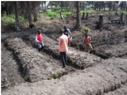
A vegetable garden KidsHub in Liberia

KidsHubs are groups of children and leaders of any age who meet together to learn a new skill while exploring the Bible and following Jesus together.