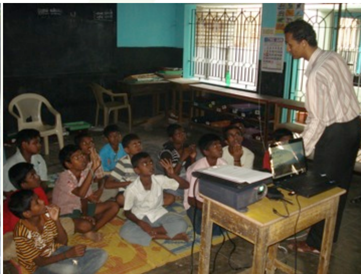
A media KidsHub in India