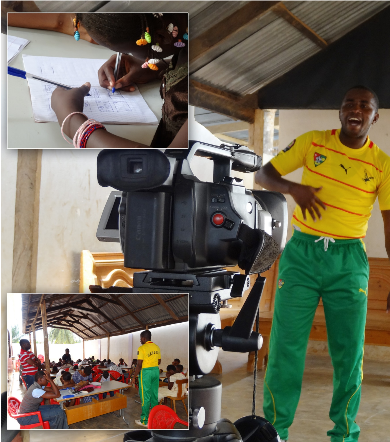
A media KidsHub in Togo!